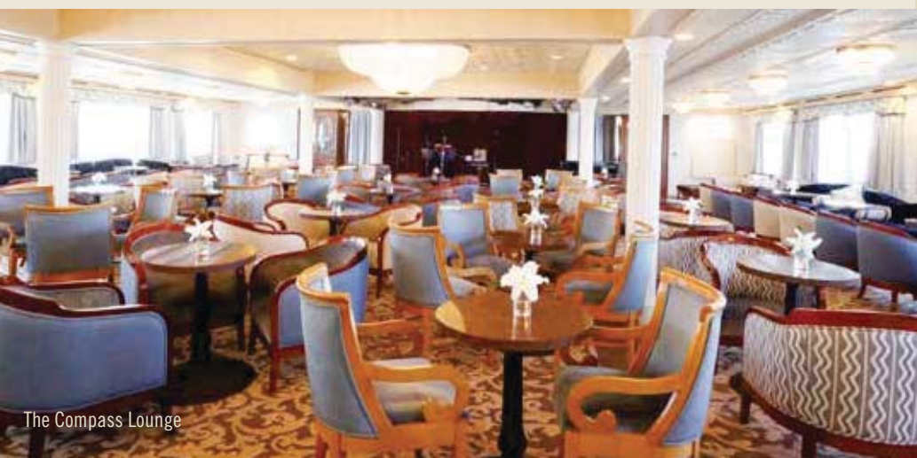
The Compass Lounge

Victory Cruise Lines may modify the cruise itinerary up to and during the voyage. All cruise accommodations and shore excursions are arranged by Victory Cruise Lines, which may use other suppliers or providers to render services. The agreement in this brochure is the exclusive and entire statement of the agreement between you and Go Next, Inc. It should be read carefully.